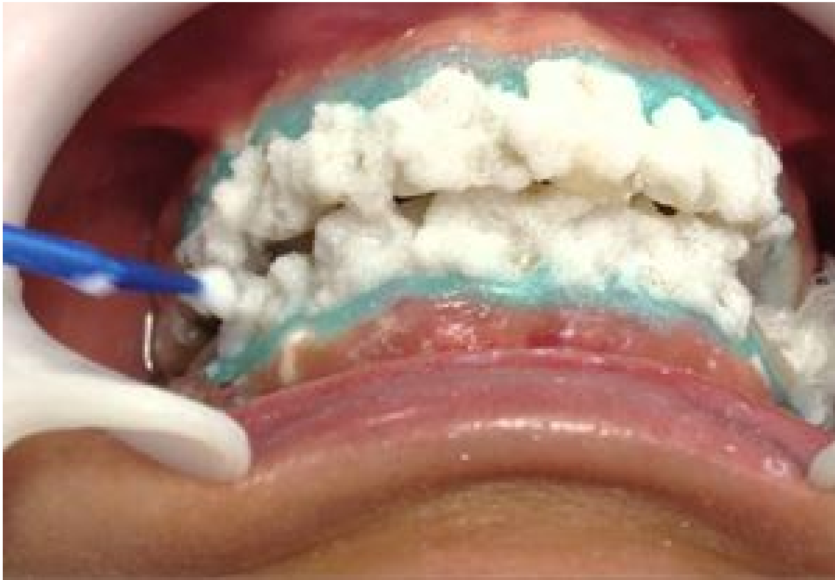
Brilliant New Device To Whiten Teeth In Minutes