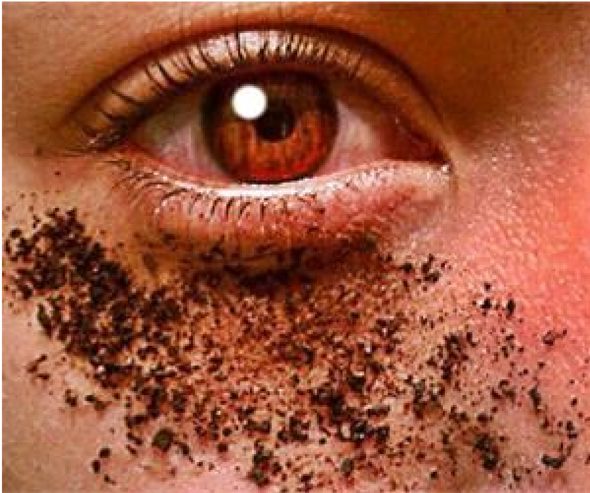
How To Remove Lip Lines & Aging Eye Bags In Under 3 Minutes