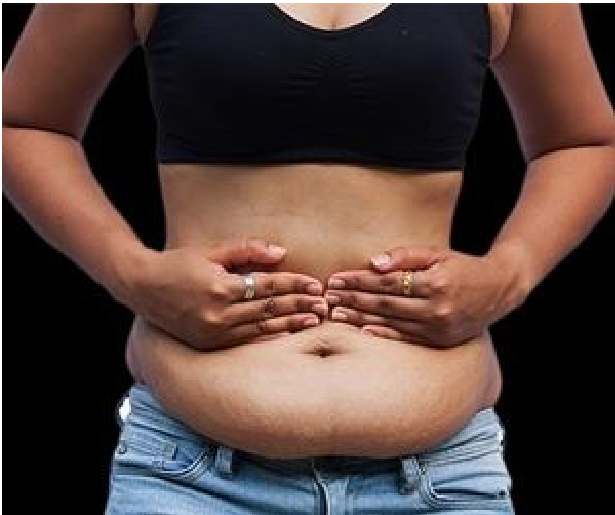
Getting Rid Of Deep Fat - Here's How